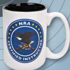
CI 30503 Instructor Mug $10.95