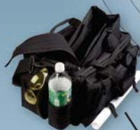
SA 20020 NRA Pro Range Bag $89.95