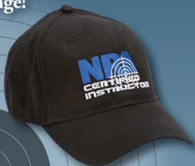
CI 30502 Black Instructor Hat $14.95