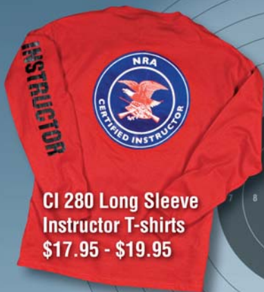
CI 280 Long Sleeve Instructor T-shirts $17.95 - $19.95

NRAstore™ products are specifically designed with instructors in mind — to make you feel even more at home on the range!